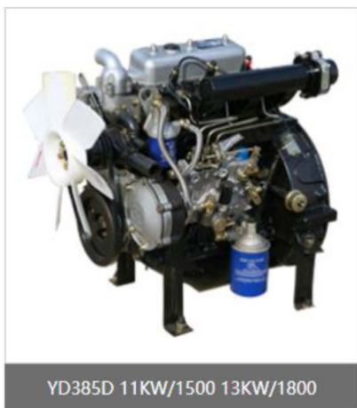
YD385D 11KW/1500 13KW/1800