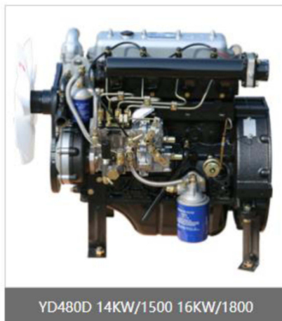
YD480D 14KW/1500 16KW/1800